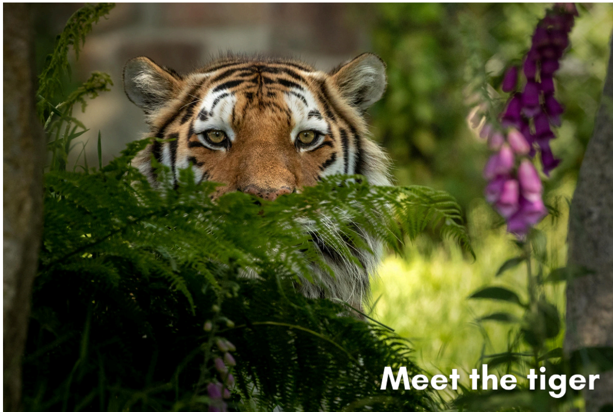
Meet the tiger

Other experiences can include feed the otters or falconry displays upon request