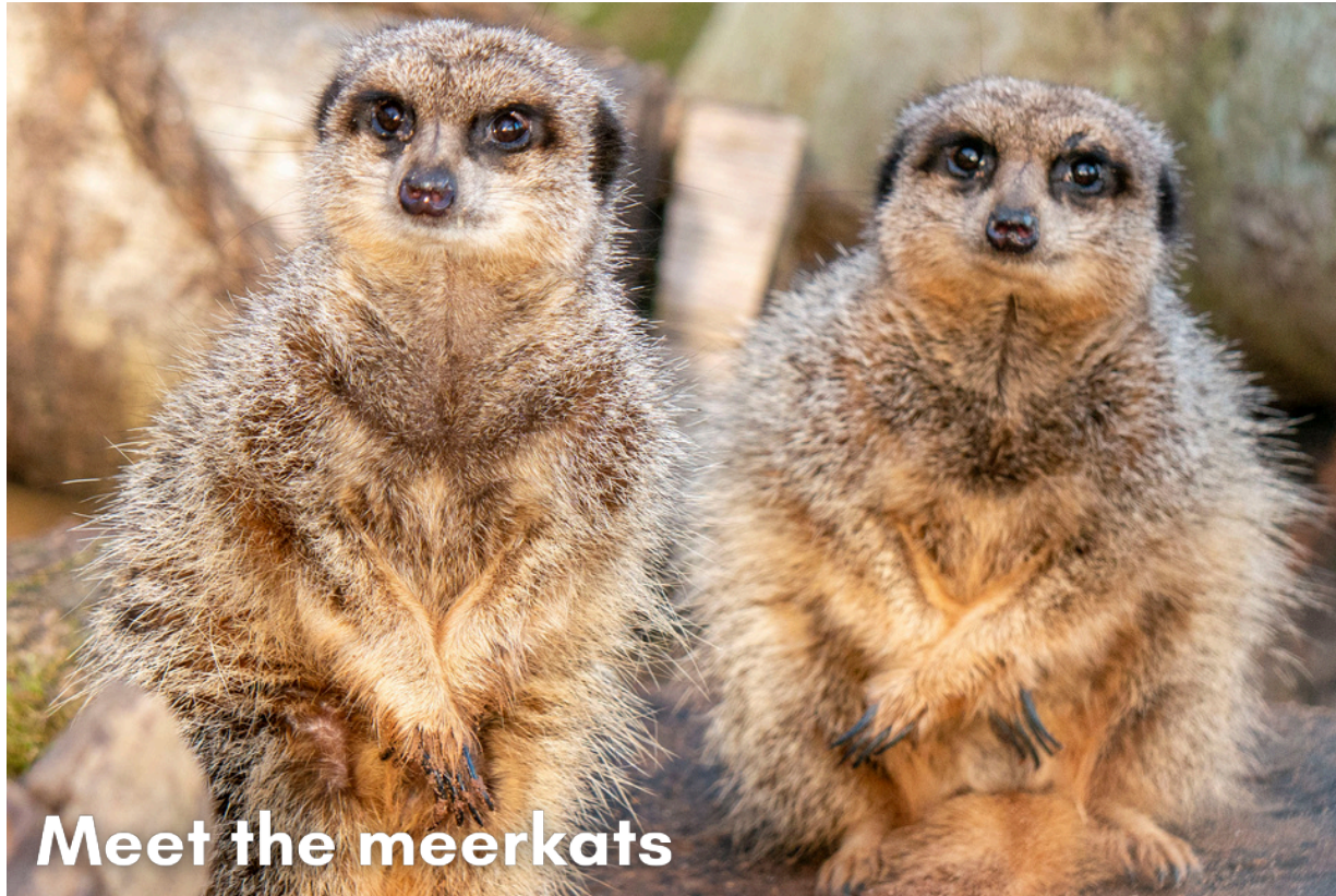
Meet the meerkats